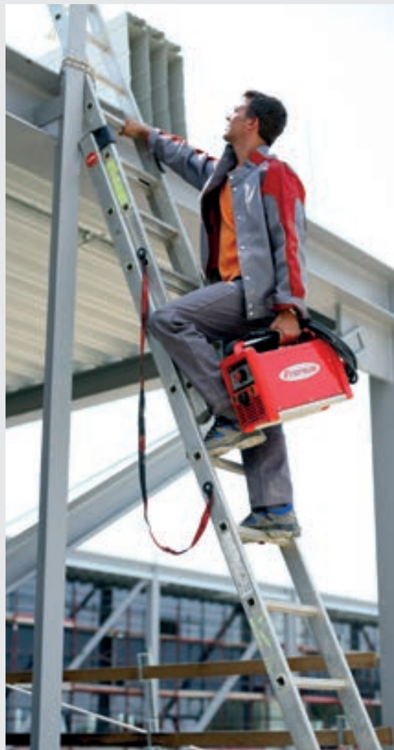
/ Lightweight and portable, and so right at home on every worksite.